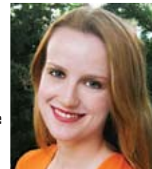
By Karen Hofreiter BOSTONNOW FOOD CRITIC

Yes, you nearly bit the head off the saccharine-smiled sales clerk at Benetton, but no, you are not a bad person — just "holiday-cranky." So sweeten your disposition with decadent treats at Finale . Start with a flight of dessert wines while nibbling on savory bites from the prelude menu — the tender petite duck confit is a must. For a flourishing sweet finish, consider sharing the Chocolate Paradise plate — a veritable choco-copia of milk chocolate coconut cake with pineapple sauce, a white chocolate Florentine cup with pineapple sorbet and many other delectable morsels. You'll leave smiling, and sales clerks around the city will thank you.