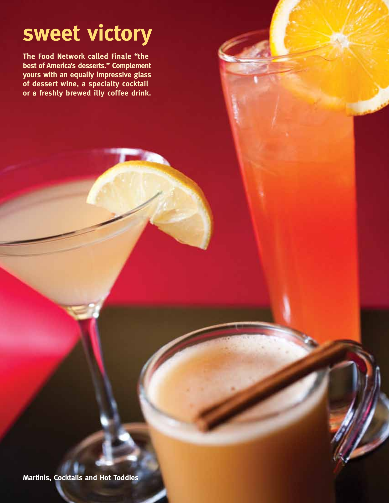
Martinis, Cocktails and Hot Toddlies

The Food Network called Finale “the best of America’s desserts.” Complement yours with an equally impressive glass of dessert wine, a specialty cocktail or a freshly brewed illy coffee drink.